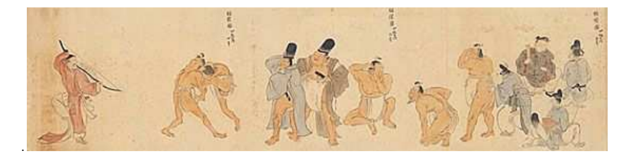
Figure2 - Sumai No Sechie

The next major landmark in the history of budo is a ritual found in the Shinto faith called Shinji-Zumo. This ritual wrestling match was said to predict the rice harvest. It came to be performed in front of the ruling emperor or empress. By the Nara jidai<sup>12</sup> Shinji-Zumo was an annual court event. During the Heian jidai<sup>13</sup>, it became a court entertainment called Sumai no Sechie. By the time the samurai came to power in the Kamakura jidai, Sumo had become a sport favoured by the samurai as a training tool, and for entertainment (Shapiro, 13-15)