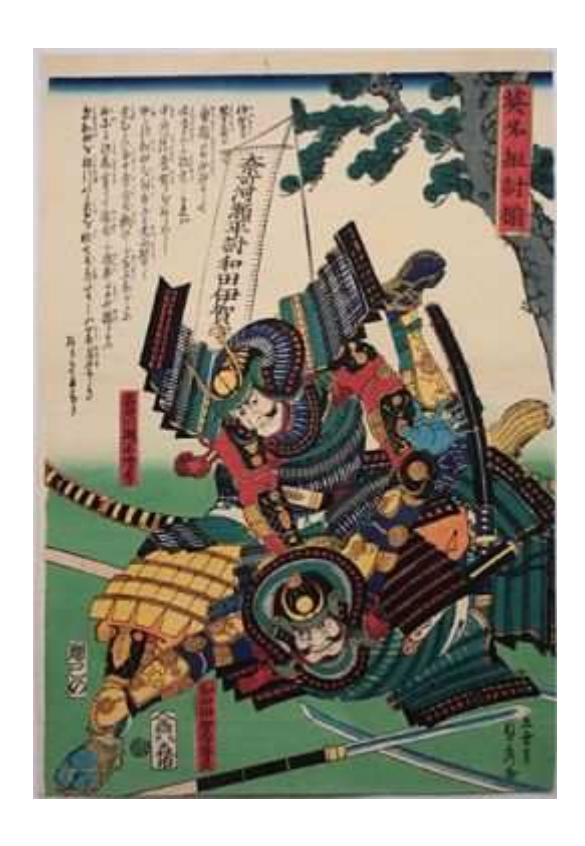
Fig 3 - Yoroi Kumiuchi

While our society focuses on pre-17th Century history, it is in the time after the Sengoku jidai that we see the beginnings of the change towards the form that jujutsu has today. The Edo period was a time of relative peace. The first change to come about in the martial arts of the Edo period was the modification of techniques to be effective in street clothes; this was called suhada bujutsu [Kanji: 素肌 武術, Meaning: Bare Warrior Art]. This manifests in an interesting way. During the Muromachi jidai there was very little striking found in the unarmed fighting methods of Japan. This was for the simple reason that striking a man in armour does more damage to yourself than it does to him. With the change towards fighting in street clothes more options for striking present themselves (Skoss).